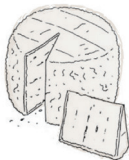
Fresh goat cheese